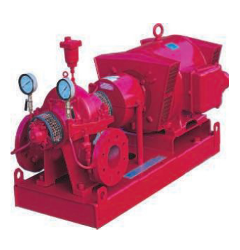
Split case electrically driven pump