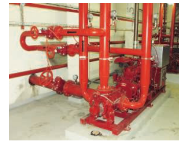
Multi stage/Multi Outlet pump in a high-rise building