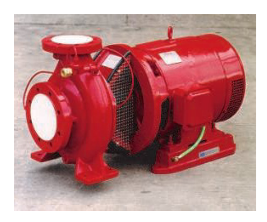
End suction, close coupled type pump