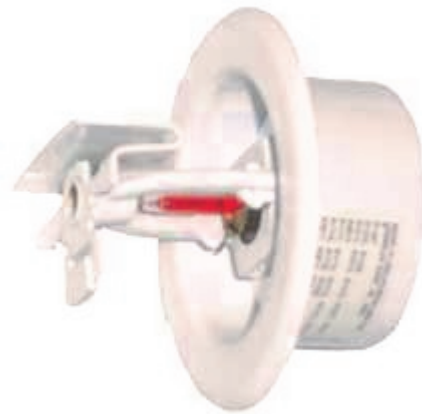
Residential Sidewall Sprinkler Head - White finish

Residential sprinkler heads are especially designed for use in residential and domestic situations. To minimise interference with decor and aesthetics these sprinkler heads can provide coverage to a larger area and the deflector is designed to distribute the water in a pattern that will ensure wetting of the walls. This