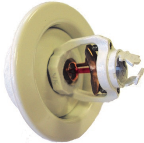
Horizontal Sidewall Sprinkler Head - White finish

These 'quick response' sprinklers are commonly used for the protection of hotel bedrooms to overcome the need for sprinklers and exposed pipework in the centre of the room. They are specifically designed to give an extended coverage of water of up to 21m 2 and are designed to inhibit fire growth by extensive wall wetting.