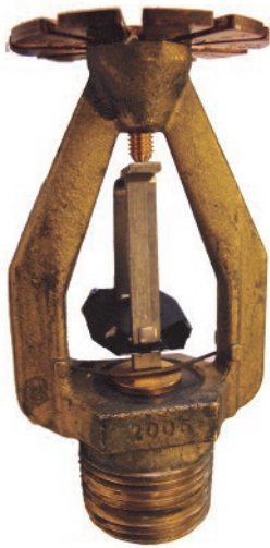
ESFR Sprinkler Head - Brass finish

Early suppression fast response (ESFR) sprinkler systems are designed to protect warehouse storage risks from fire, particularly in cases where roof only sprinklers are preferred to the more usual in-rack sprinkler protection.