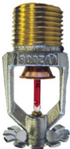
Pendent Spray Sprinkler Head - Chrome finish

Spray sprinklers are used for applications where all the water needs to be discharged downwards.