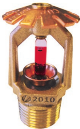
Conventional Sprinkler Head - Brass finish

These can be mounted in either the upright or the pendent position, and the deflector is designed to spray a proportion of the water discharge on to the surface of the ceilings.