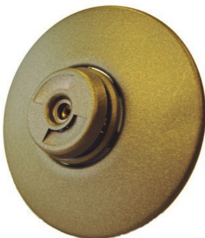
Residential Sprinkler Head - Wood effect finish

Fire sprinklers are installed in a wide range of locations and applications. The materials and finishes of heads take into account the requirements of their surroundings. External finishes can be specified to meet aesthetic requirements. In other applications, where corrosion in the atmosphere may be a concern, heads can be either made of specialty metals such as stainless steel, or covered with corrosion resistant coatings or wax, or a combination of these.