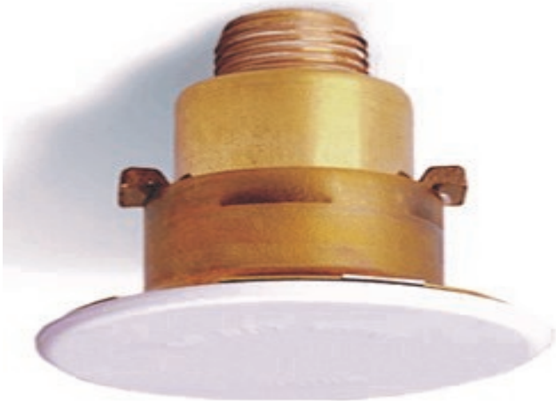
Concealed Sprinkler Head - White cover plate

These are sprinklers which are located flush with the ceiling; all that is visible is a small diameter metal disc concealing the sprinkler head behind. This disc is soldered to a support bracket which when heated